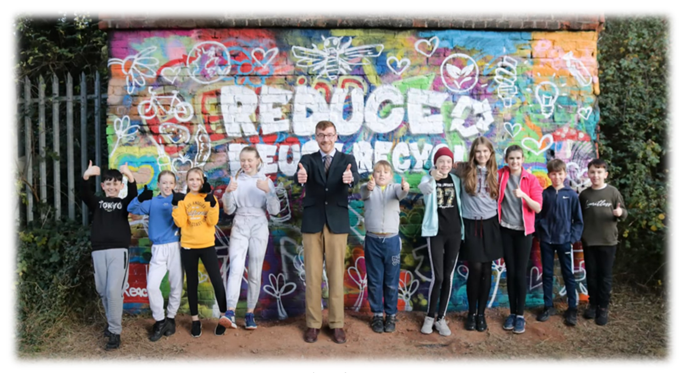
Image: Reduce, Reuse and Recycle' graffiti mural on the Newark Sustrans route

"The graffiti wall that was done @ Clipstone Youth Club is absolutely amazing, thankyou to Newark & Sherwood & to the graffiti artists. Its truly made the youth club a centre place of our village."